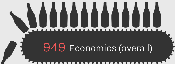
Opus One Quality score vs average market price