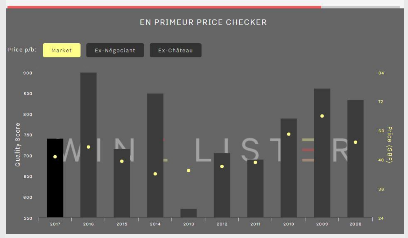
Visit the <u>Duhart-Milon 2017</u> page to access the interactive chart.