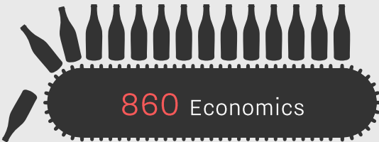
Brane-Cantenac Quality score vs average market price

#4 MOST POPULAR MARGAUX WINE, WITH 2,196 SEARCHES ON WINE-SEARCHER EACH MONTH